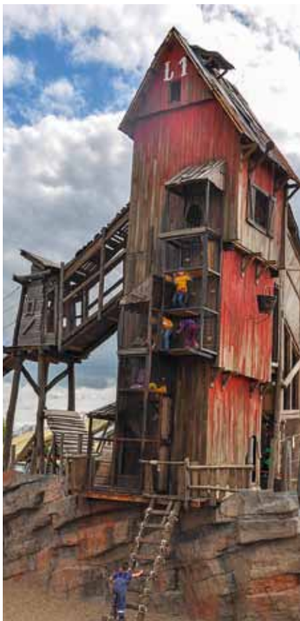
Mine tower, Jaderberg