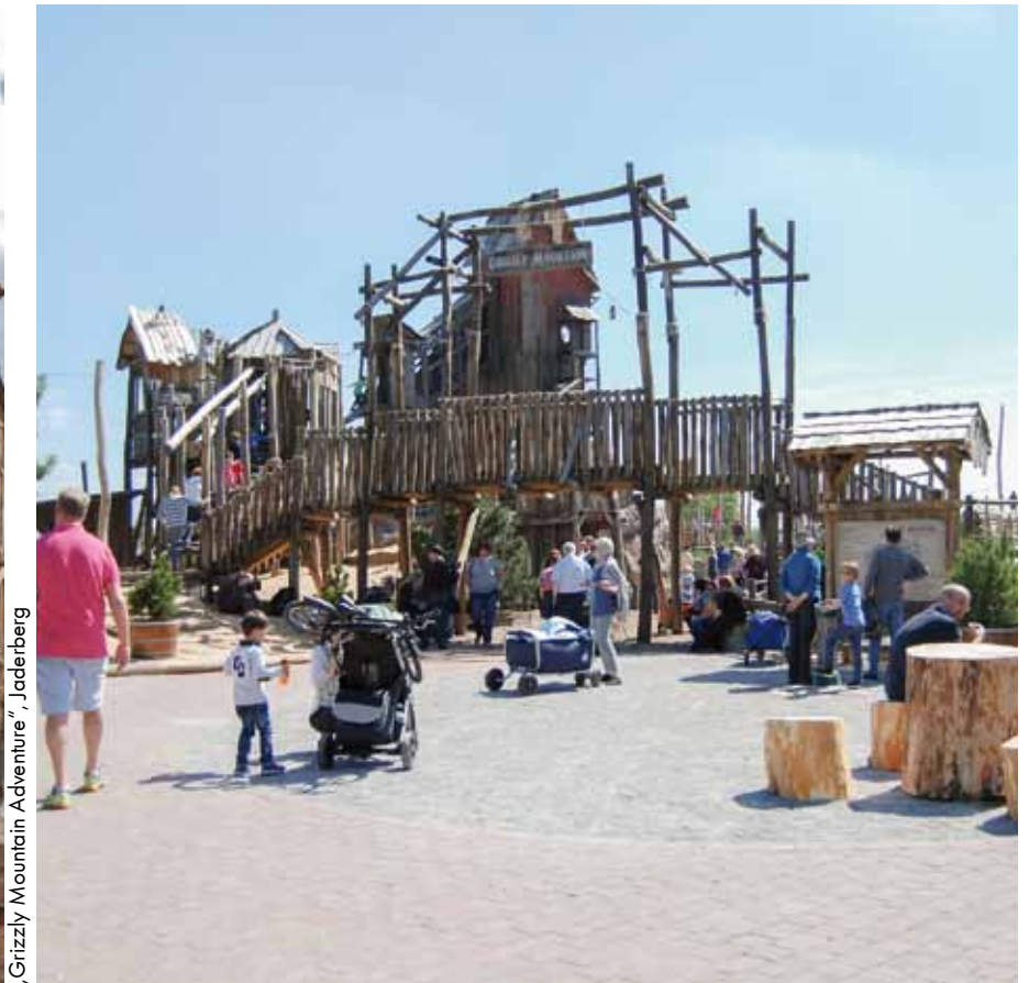
„Grizzly Mountain Adventure“, Jaderberg