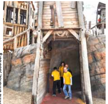
Mine entrance, Jaderberg