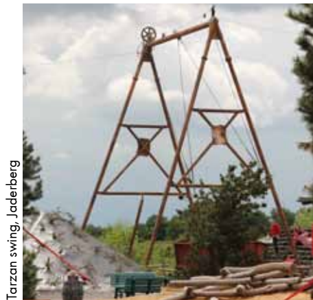
Tarzan swing, Jaderberg

Europe's largest wooden climbing park - „ Grizzly Mountain Adventure “ in Jaderberg on the North Sea. It comprises a huge mountain scene with its own canyon and is set in the thrilling era of the Klondike Gold Rush. The design, planning and implementation of this project was fully completed in-house by us.