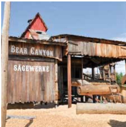
Saw mill, Jaderberg